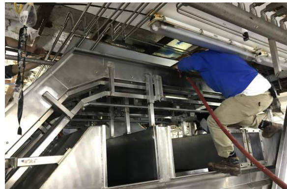
Some foam was tough to monitor