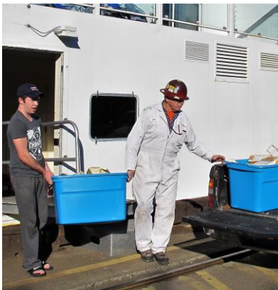
No Forklift Handy