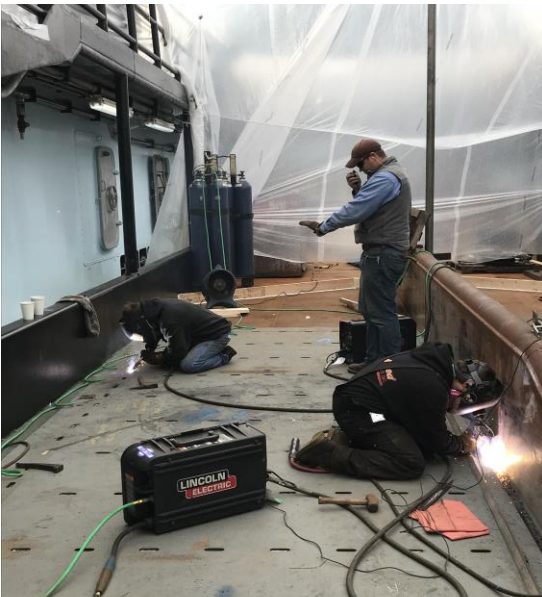
Radio contact with the firewatches below..