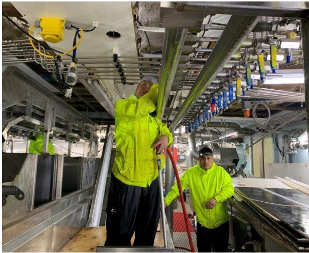
Costly and stressful as the job was, avoiding a destructive foam fire remained the absolute bottom line.

After a couple days' supervisory stress, the main deck welding was done and the ceiling paneling replaced.