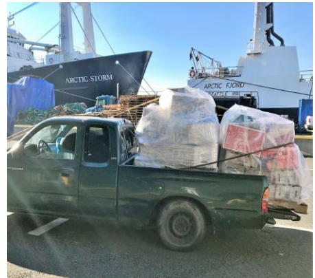
Down on the Springs

Remember, Generous Companies: We have access to freezers and coolers! Not a fishstick should go in the dumpster! And though some stores may seem a bit institutional (like 14 gallons of maraschino cherries...) nothing goes to waste!