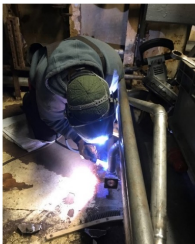
TIG Welding Stainless Pipe

Note the TIG-welder in the photo. He's out on the process deck. Not nearly as much fume as stick-weld. So, no need for that irritating ventilation, right?